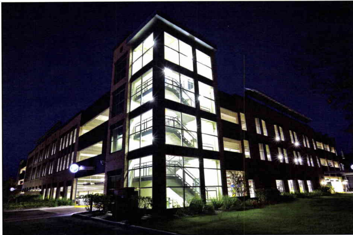
Old Town Parking Deck