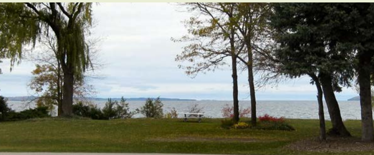
WEST BAY WATERFRONT