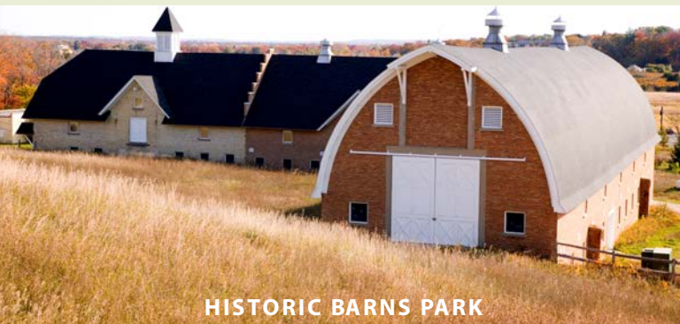
HISTORIC BARN PARK