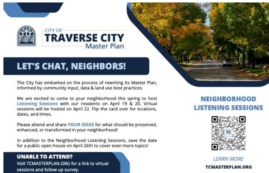
Pictured above: Postcard mailed to every city resident marketing the listening sessions (along with email, social media, and paid media advertising).