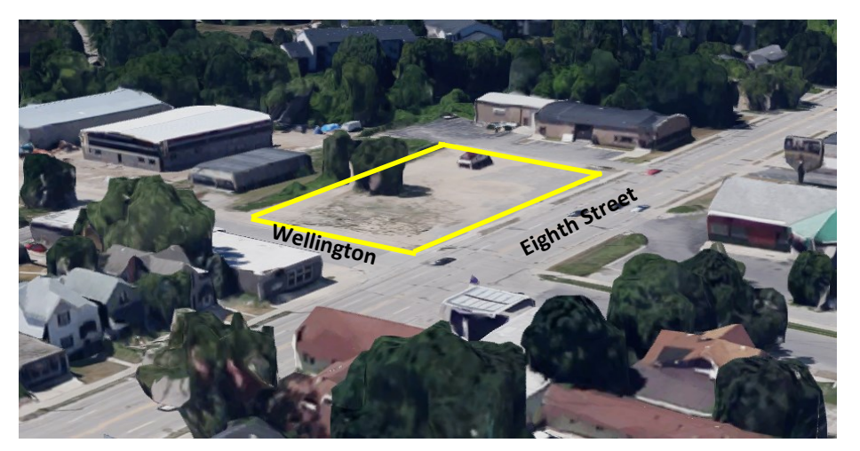
SUBJECT SITE FACING SOUTHWEST