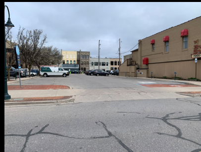
Parking Lot G curb-cut infill $43,000