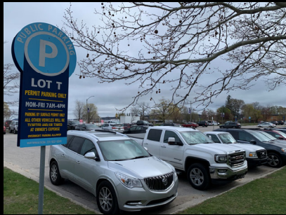
Parking Lot T patch work $34,000