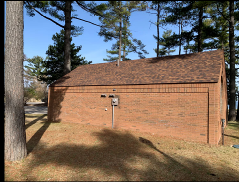
Art in Parks Initiative