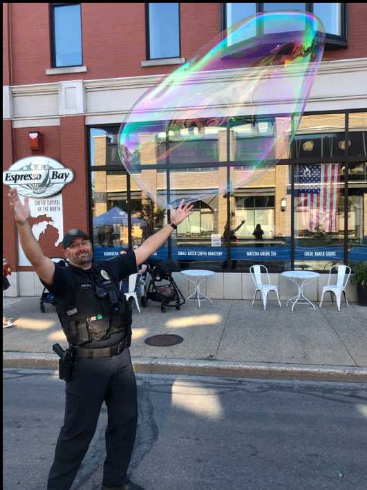
Community Police Officer $120,000