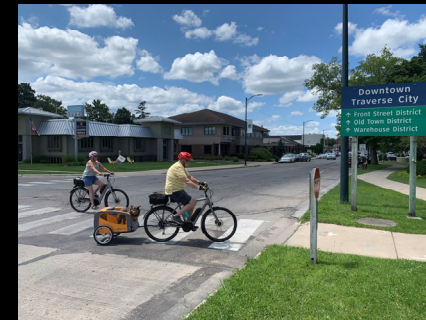
Mobility Action Plan Implementation $50,000