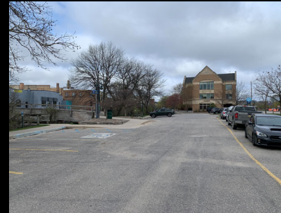
Parking Lot C resurfacing $43,000