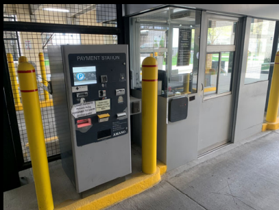
Professional, Contractual & Information Technology $1.4 M