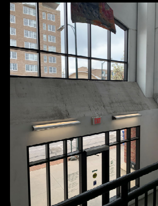
Hardy Parking Structure Pedestrian stair-tower maintenance $150,000