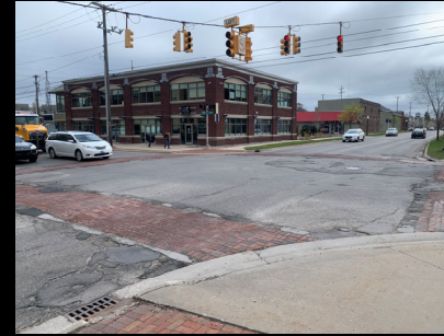
Eighth Street Intersection Improvements at Cass & Union $300,000