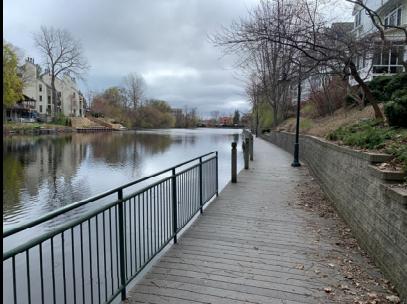
Midtown Riverwalk Upgrade & Replacement $300,000