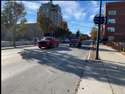
Two-Way Pilot Project $200,000