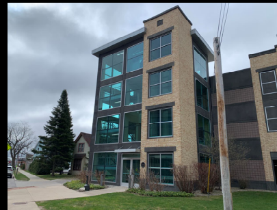
Old Town Parking Structure Pedestrian stair tower maintenance $100,000