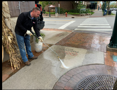
Maintenance and Operation