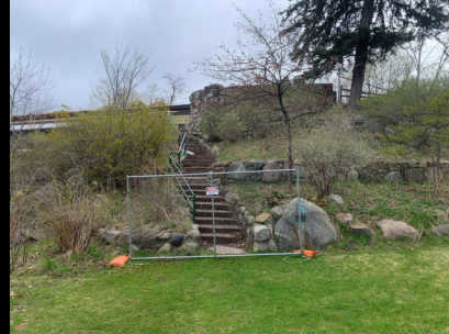
Hannah Park Improvements $70,000