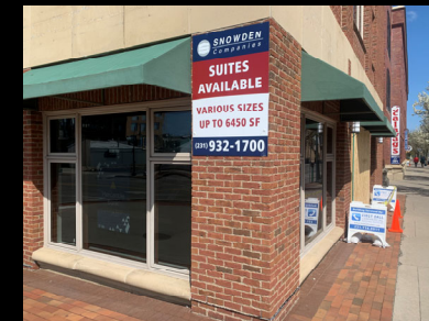
TraverseConnect Service Agreement