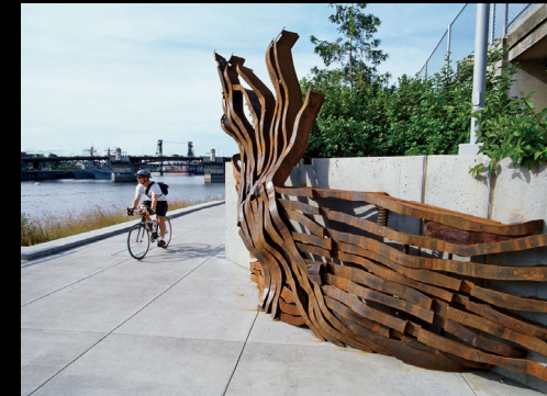
TART Trail Extension