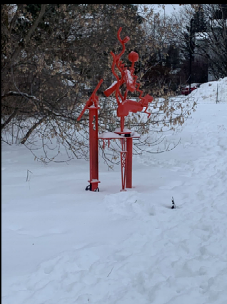
Boardman Loop Trail Replacement