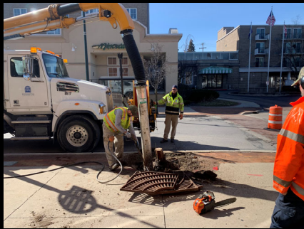
Service Agreement w/City