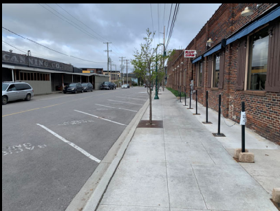
Streetscape Improvements and Snowmelt $100,000