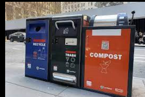
Downtown Composting Program $100,000