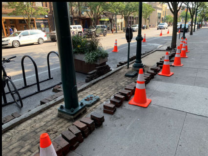
Streetscape Improvements and Snowmelt $325,000