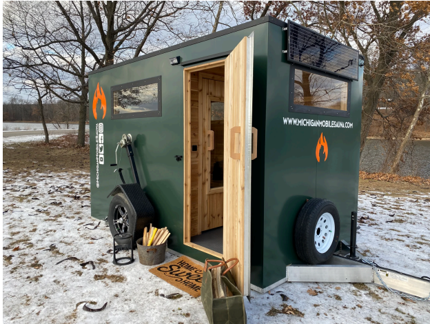
Michigan Mobile Sauna, New Hudson, Mi