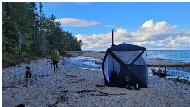
Sleeping Bear Saunas, Traverse City, Mi