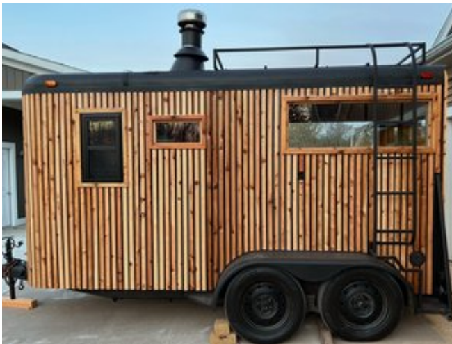
Howl at The Moon Sauna Co, Rockford, Mi