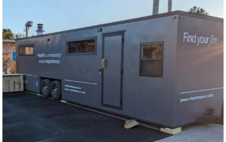
Hearth Sauna, Traverse City, Mi